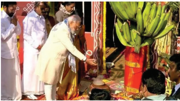
Agency. New Delhi

Prime Minister Narendra Modi, on the occasion of Pongal, appealed to Tamil youth to adopt sustainable agriculture and play a leading role in environmentally friendly farming. He said that farming should be developed in such a way that it ensures food security, economic prosperity, and environmental protection. The Prime Minister described nature conservation, water management, natural farming, agritech, and