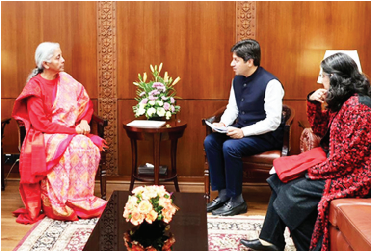
FICCI has demanded rationalization of provisions to enable release of funds stuck in litigation, ease working capital blockage for taxpayers, and provide for complete stay on demand during appeals without

involving 18.16 lakh crore were pending. According to FICCI, the Central Action Plan (CAP) for 2025-26 aims to dispose of 2 lakh cases and resolve disputed demands worth 10 lakh crore across different charges. However, without capacity augmentation or separate tracks and timelines, clearing the backlog will be difficult. The statement said that pending litigation appears as contingent liability in companies' books, which lowers valuation when Indian promoters sell shares to FDI investors. A large backlog of cases also results in revenue loss for the government.